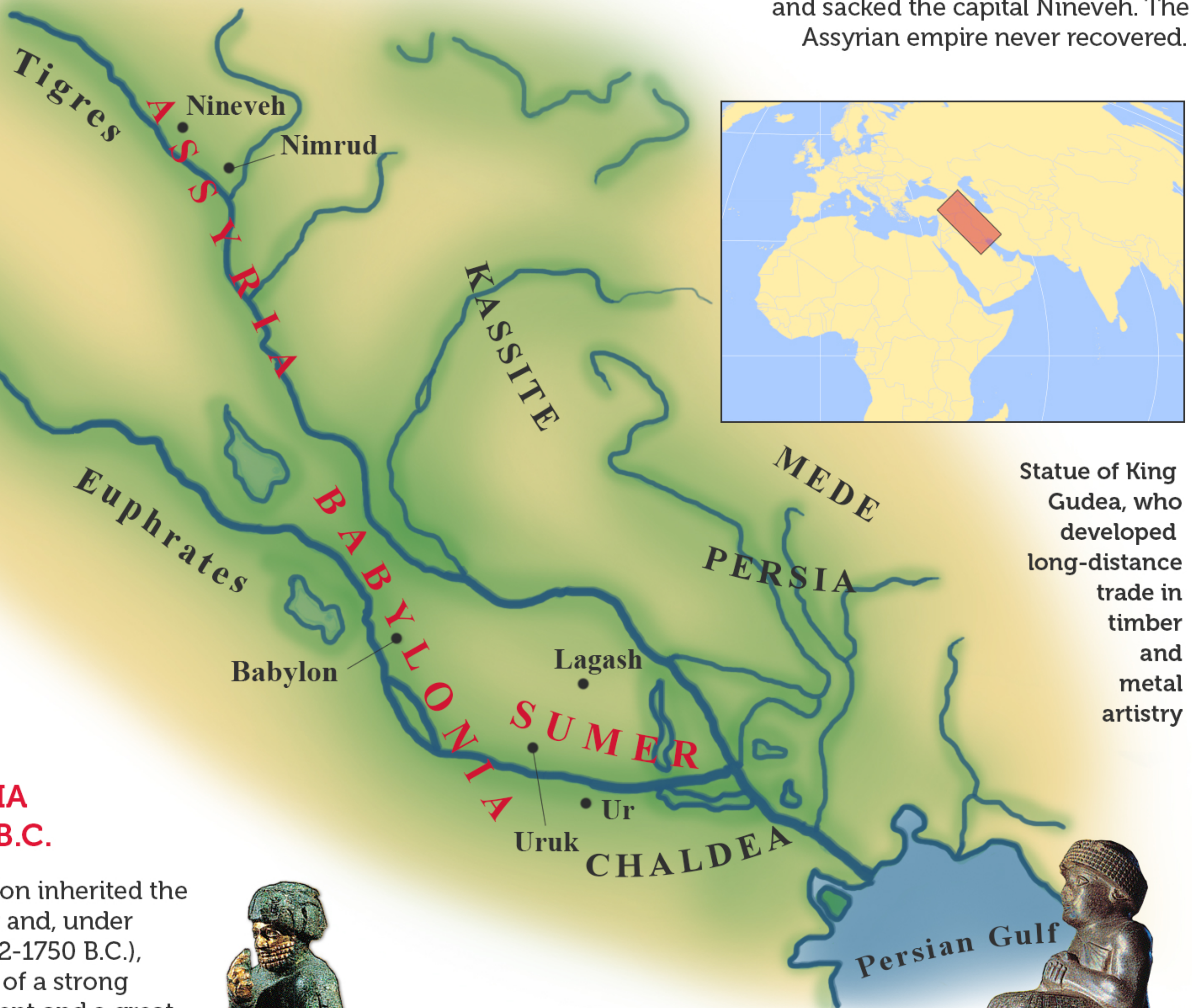
Statue of King Gudea, who developed long-distance trade in timber and metal artistry