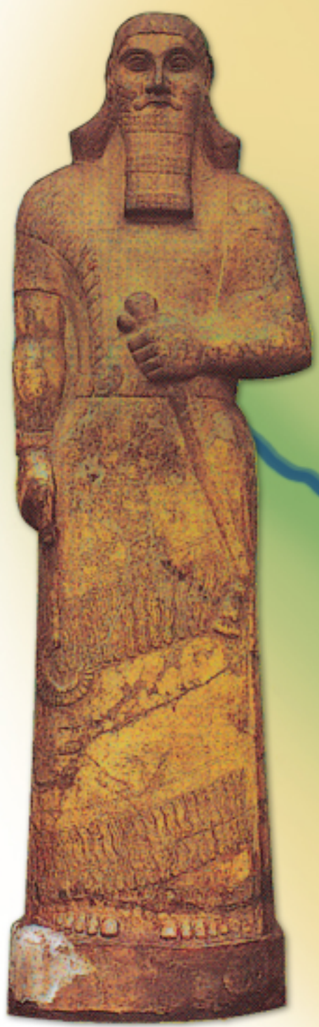
Assurnasirpal II, king of Assyria.

In hilly northern Mesopotamia, the small city-state of Assyria slowly grew to become a powerful kingdom. Using chariots, battering rams, and armored horses, the Assyrians conquered Babylon in 689 B.C., as well as other independent states, uprooting the people they conquered and forcing them into slave labor. However, in 612 B.C., Chaldean people from southern Babylonia, who had gained control of Babylon, joined the Medes people from Iran and sacked the capital Nineveh. The Assyrian empire never recovered.