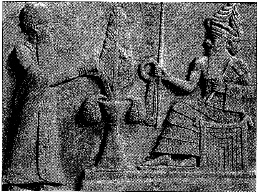
A stone carving, c. 2060 B.C., depicts a Mesopotamian king making an offering to the moon god.

Before Hammurabi conquered them, most of the city-states had been deadly enemies. They didn't trust each other. They looked for excuses to fight. The tiniest disagreement could turn into another full-scale war.