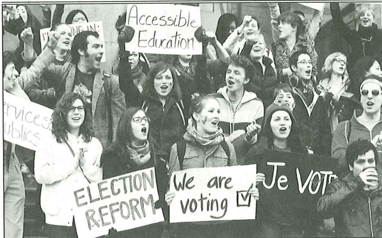
Students at McGill University in Canada gathered in 2011 as part of a “vote mob” to encourage young people to vote in the next election.

According to recent polling by the Pew Research Center, American millennials tend to be in worse economic shape than their parents and grandparents. But they are also more optimistic, more tolerant, more politically liberal, less in favor of smaller government, and less likely to vote.